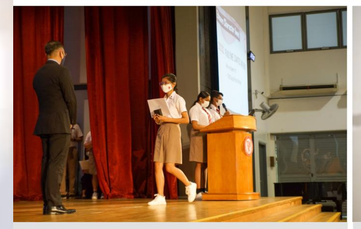
Award recipient appearing on stage with our Guest of Honour