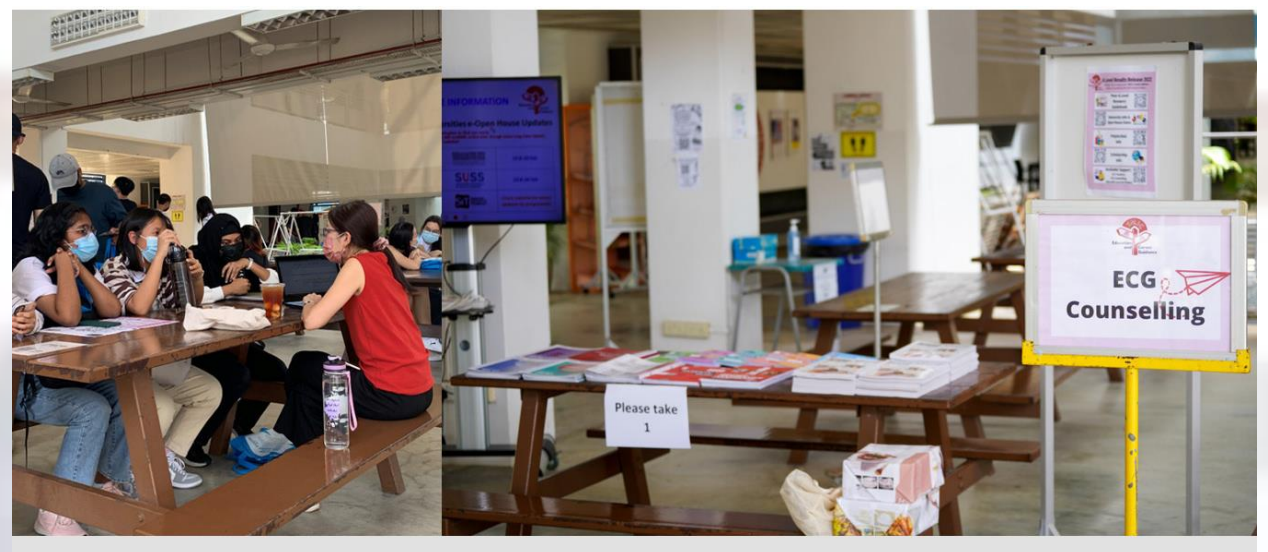
ECG Counselling Booths

On 22nd February 2022, our Class of 2021 returned to college to receive their GCE A-Level Examinations results.