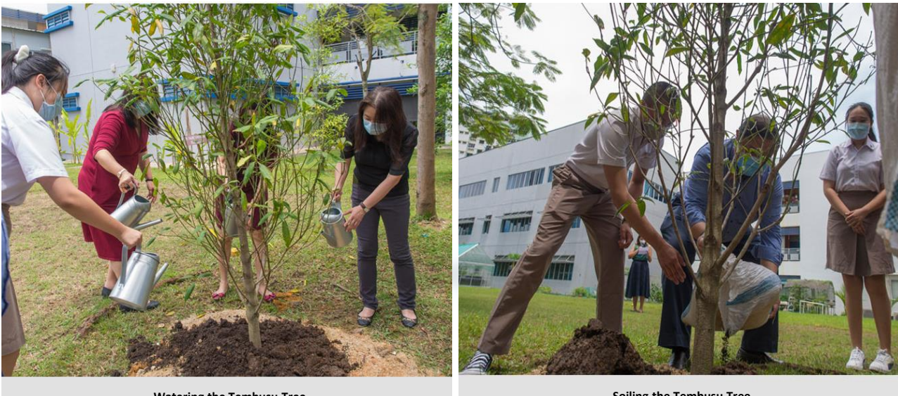
Watering the Tembusu Tree