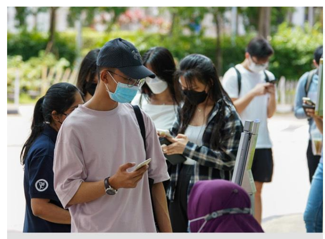
Class of 2021 returning to College