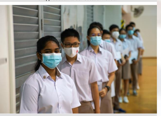
Award recipients waiting in line to appear on stage

On 26 January 2022, TMJC held our JC1 Awards Ceremony to recognise and celebrate the good work of students in their JC1 journey in 2021. This year, the College introduced the Highest Distinction in Subject award to recognise students who have attained distinction and outstanding performance in the different academic subjects. Students who performed well in their JC1 assessments were presented with the TMJC Book Prize (Bronze) and they can continue to strive to achieve the Silver medal for exemplary performance in JC2 Assessments and the Gold medal for sterling results at the GCE A-Level Examinations. This series of awards serve to inspire our students to consistently do their best in their academic journey in TMJC.